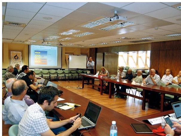
During the technical workshop, experts from the RAC sector can exchange on policy and technical issues related to natural refrigerant technologies