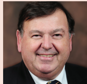
Minister Donald Grant

The Provincial Minister is Donald Grant. He is an elected politician who is responsible for directing the Department's activities so that these are in line with national and provincial government policies.