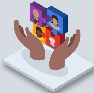
Head of Department