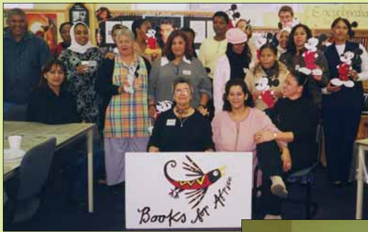
Above: Librarians from Cape Town City Libraries with cutouts of Micky Mouse made at a styrofoam-cutting workshop held at Rylands Library in June this year