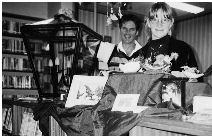
Entrepreneurs by hul uitstallings tydens die bekendstelling van Bredasdorp Openbare Biblioteek se Biblioteekbesigheidshoekie