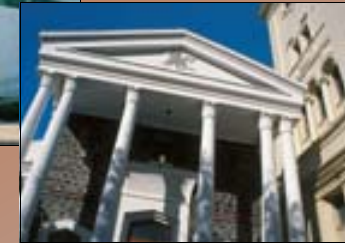
Far left: Built in cream coloured, textured Jerusalem stone the South African Jewish Museum holds a wealth of information

Left: The entrance to the museum is housed in the classic old Synagogue building and this is joined to the modern section by means of a glassed-in passage resembling the gangplank of a ship, which is symbolic of the arrival of the Jewish immigrants in the late 19th century