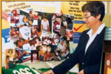
Bo: Suzette Marais van Bredasdorp Biblioteek by die foto-collage van lesers wat saamgestel is deur Andrie Scheltema van die F-Stop Foto-grafiese Skool

From the feedback received it is clear, however, that this year's promotion was less exciting than previous years, a lamentable fact as it was an ideal opportunity for libraries to be very visible in their town by plastering lamp-posts and other public areas with the 'election' posters. Unfortunately this seemed not such a good idea, but many librarians nevertheless provided some wonderful activities during this important week on the library calendar and we invite you to share in some of these on this and the following pages..!