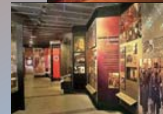
Above and left: These two pictures of the Holocaust Centre are but a fraction of the most incredible and fascinating display which occupies a large section of the top floor of the building which houses the library