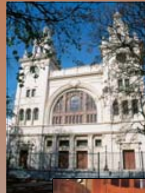
Left: The imposing Great Synagogue was built in 1863 to house the growing Hebrew congregation. It was designed by Parker and Forsyth. This view overlooks the Gardens and is not used as an entrance

Left: The entrance to the museum is housed in the classic old Synagogue building and this is joined to the modern section by means of a glassed-in passage resembling the gangplank of a ship, which is symbolic of the arrival of the Jewish immigrants in the late 19th century