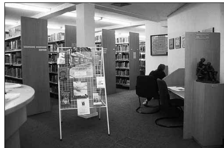
Private cubicles for reading or study purposes - a quiet area for users

The library is computerised, working with the Libwin system. The book collection