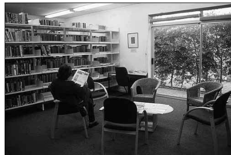
Users can relax in this serene section of the library where many Jewish and other newspapers and magazines are housed