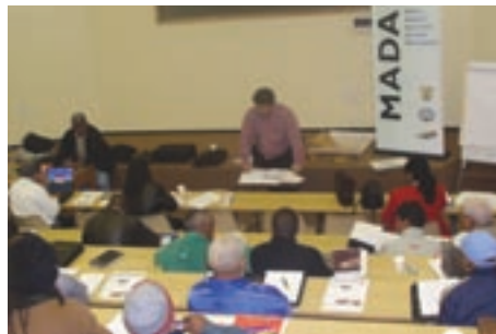
Input, ideas and inspiration kicks off planning for integrated Youth Holiday Programmes

The Western Cape Education Department, Department of Cultural Affairs & Sports, Department of Community Safety, City of Cape Town (Sport & Recreation and Community Development) and the South African Police Services (SAPS) held a joint workshop to develop an integrated framework for holiday & youth programmes in the Western Cape.