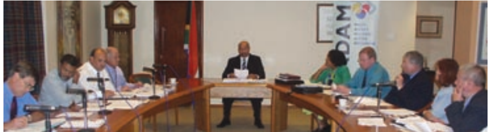
MADAM Management Committee leading from the front in synergising with three spheres of government and civil society