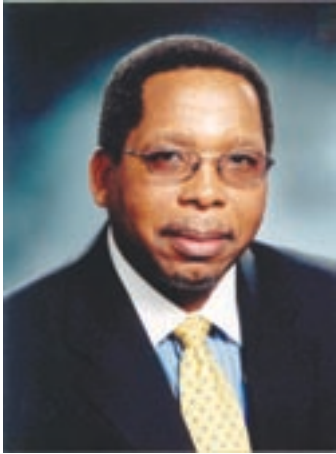
Leonard Ramatlakane Minister of Community Safety

The fight against poverty and criminality in the Western Cape must be faced head on. Crimes relating to drugs, gangsterism and other social evils amongst