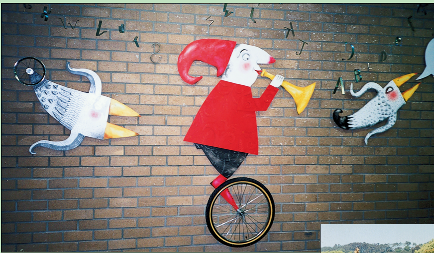
◁ Die pretmuur in die kinderafdeling van Bellville Biblioteek geskep deur die bekende en talentvolle Piet Grobler