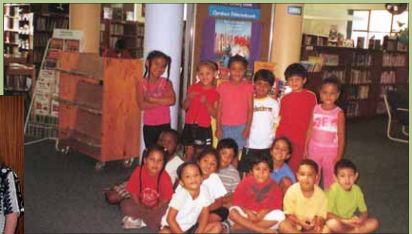
Above: A happy group of young users in Somerset West Library