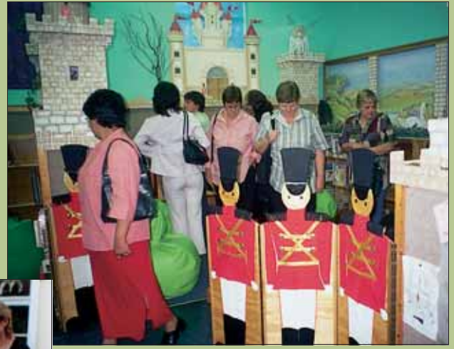
Bo: (links) 'n Pragtige fynbosuitstalling in Kleinmond Biblioteek en (bo regs) word kinders vriendelik deur kiertsregop soldaatjies genooi om hul tuis te maak in die kinderafdeling