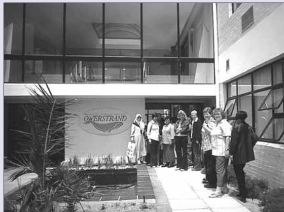
Regs: Op besoek aan Hermanus Biblioteek tydens die opleidingstoer