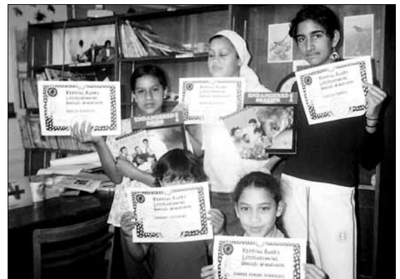
Young users who received reading awards during a packed with activity holiday programme held at Woodstock Library

The Learning Cape Festival has become an annual and well-publicised event. The Library Service identifies with the festival's aim to promote the Western Cape as a learning region and also to promote a culture of lifelong learning for economic growth, personal development and social justice for all its citizens. Relevant information, pamphlets and posters focusing on this aim, careers and the library profession would be helpful for future events.