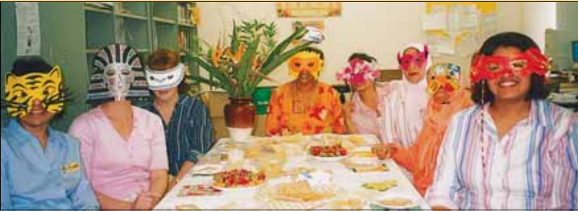
Above: The exhibition held during the Learning Cape Festival in the town hall in Worcester was very well attended