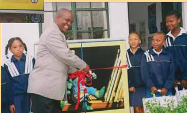
Left and below: The precious Wheelie Wagon all 'wrapped up' before the ribbon-cutting ceremony by MEC Stali surrounded by excited children from the area