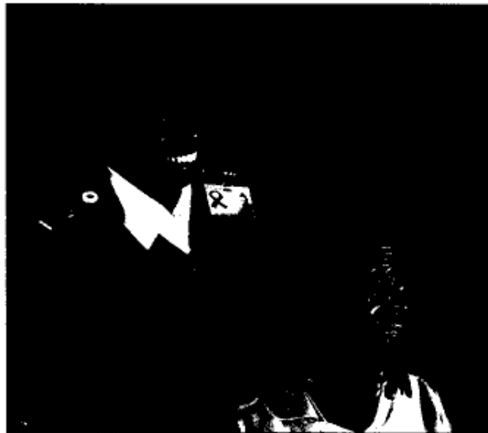
A severe case of goitre in Northern Province.

I odine deficiency disorder occurs when there is a lack of the mineral iodine in the human body. A lack of iodine hampers the development of the brain in children and leads to goitre in adults. Severe iodine deficiency disorders may include mental retardation, cretinism, abortion and hypothyroidism.