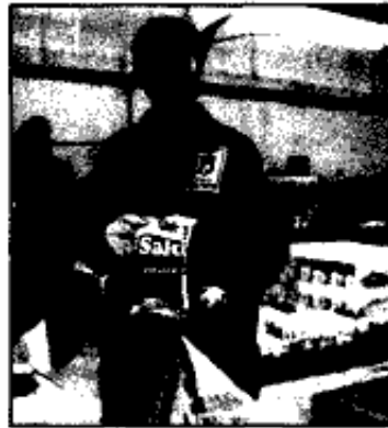
Salt factory in Northern Cape.

"Some clients say they want that particular bag of salt, the green or blue package, it tastes better. But it's all the same salt, one can't taste better than the other."