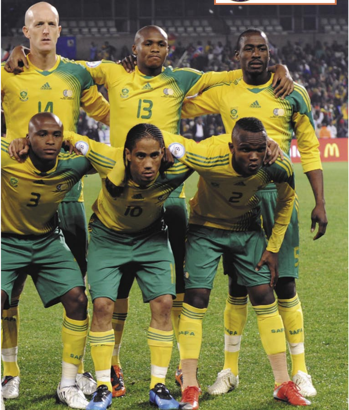
Matthew Booth, Kagisho Dikgacoi, Benson Mhlongo. Tsepo Masilela, Steven Pienaar, Siboniso Gaxa.

Department of Cultural Affairs and Sport Departement van Kultuursake en sport Isebe leMicimbi yeNkcubeko neMidlalo