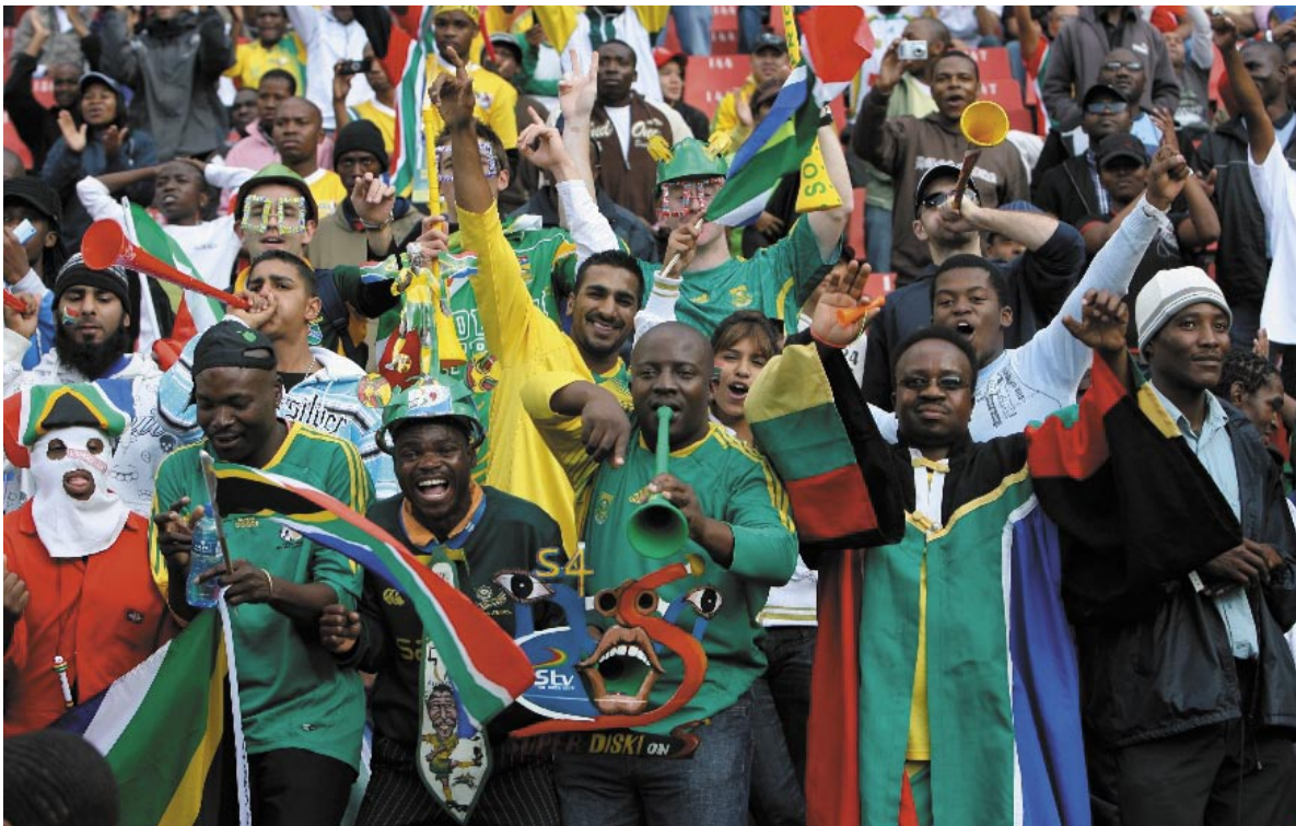
Fan Ambassadors: South African fans get behind the national team during Bafana's 2009 Fifa Confederations Cup campaign.

Go out and live soccer, feel soccer, play soccer and "touch the World Cup".