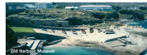
Old Harbour Museum