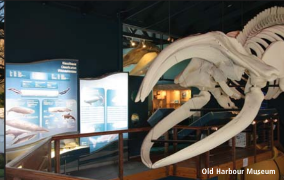
Old Harbour Museum