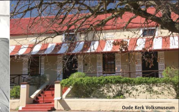
Oude Kerk Volksmuseum