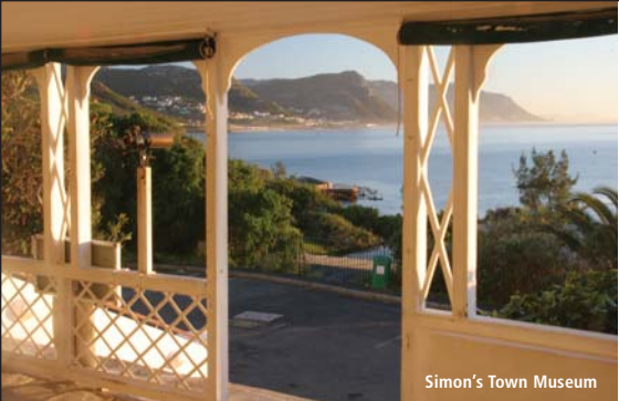
Simon's Town Museum