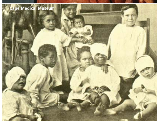
Cape Medical Museum