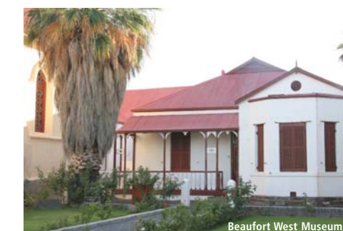
Beaufort West Museum