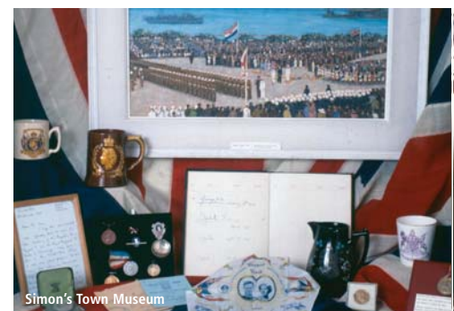
Simon's Town Museum

Simon's Bay was used as a winter anchorage for DEIC ships from the 1740s. In 1814 - the year the Dutch formally ceded the Cape colony to Britain - the Royal Navy established a naval base here, which was handed over to the South African Navy in 1957. Exhibits on the town's military history include displays on the Boer Prisoner of War Camp at Boulders in 1901, and the Royal Navy's famous mascot, Just Nuisance, a Great Dane dog that served as an Able Seaman in the early 1940s.