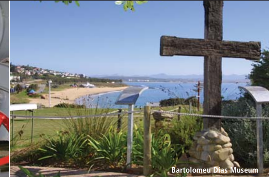
Bartolomeu Dias Museum