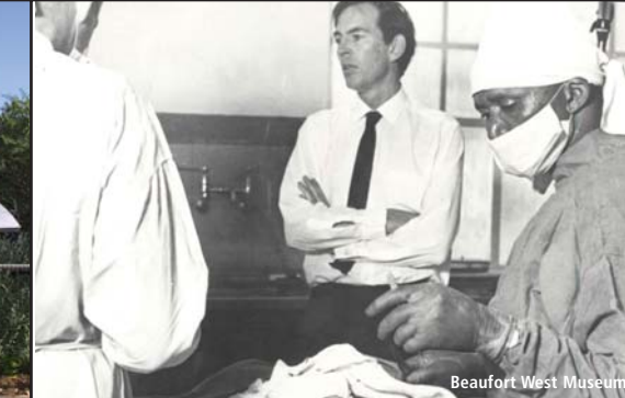
Beaufort West Museum