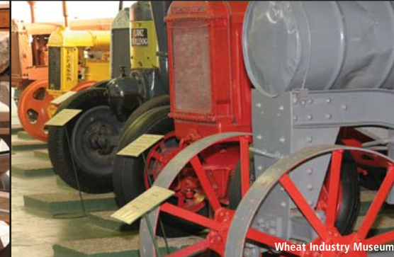
Wheat Industry Museum