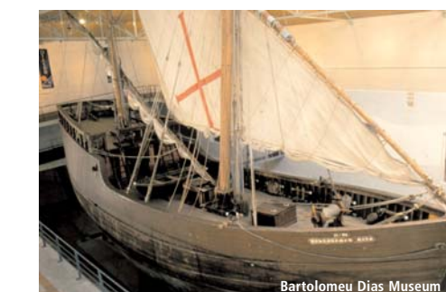
Bartolomeu Dias Museum

The Shell Museum not only showcases beautiful shells from all over the world, but also contains an exhibit on whales and dolphins, and an aquarium and touch tank with live specimens of South Africa's marine life. In the grounds of the museum complex is the Post Office Tree, a large milkwood under which letters were left for passing travellers, beginning in 1500. Letters can still be posted in a box at the tree, and are stamped with a special frank by the local Post Office. There is also an ethno-botanical garden featuring plants used for medicinal purposes and traditional beliefs, as well as food and shelter. A Braille Trail makes it accessible to sight-impaired visitors.