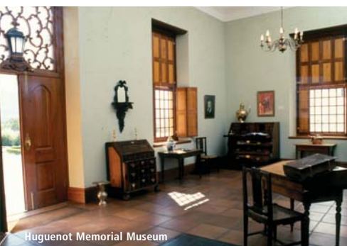
Huguenot Memorial Museum