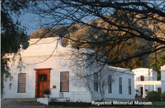
Huguenot Memorial Museum