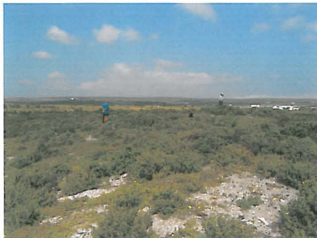
Plate 3: view of site facing East, 20 August 2004.