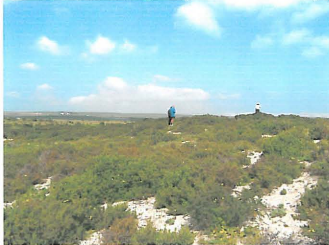
Plate 1: view of site facing East-South East, 20 August 2004.