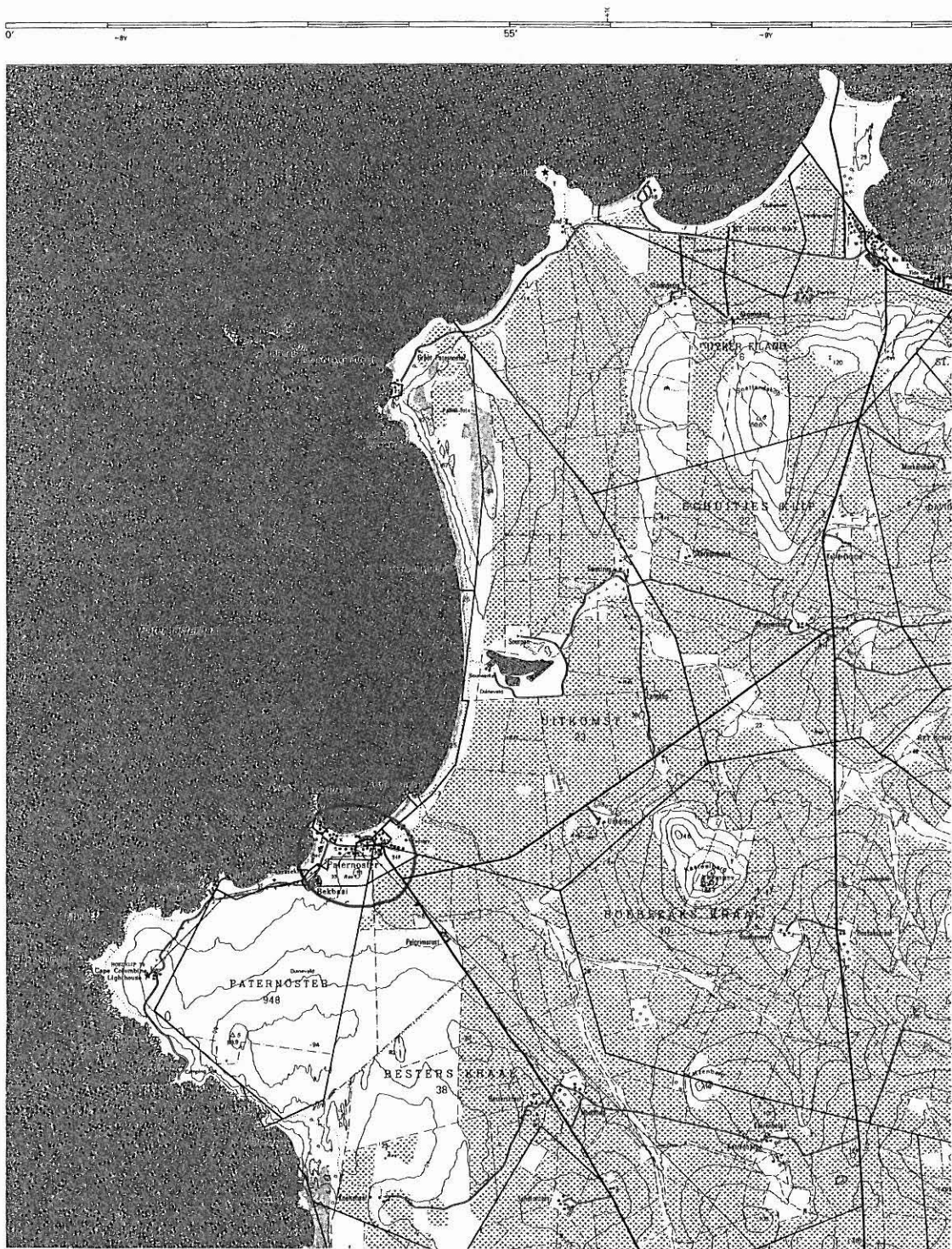
Locality Plan of PNNA shell mound