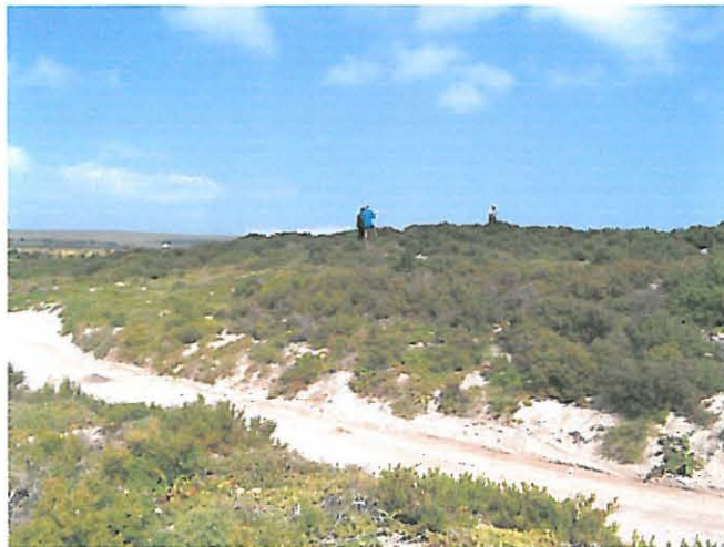
Plate 2: view of site facing East-South East, 20 August 2004.