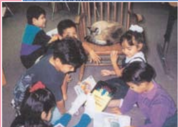
Monty, the resident cat at Montgomery Elementary School Library, Farmers Branch, Texas

They were the mascots of Baker & Taylor, the world's largest distributor of books to libraries and bookstores. Another cat promoted by the LCS is Muffin, who was evicted from a library in Putnam Valley, New York, because one of the library's trustees became allergic to cats. Two local residents were so disheartened by the eviction that they deleted the library from their wills, costing it $80 000 in legacies.