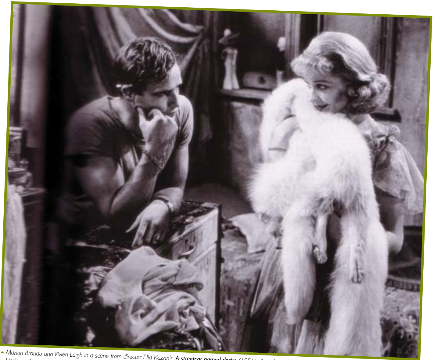
▲ Marlon Brando and Vivien Leigh in a scene from director Elia Kazan's A streetcar named desire (1951). Brando is known as a method actor whereas Leigh is old Hollywood