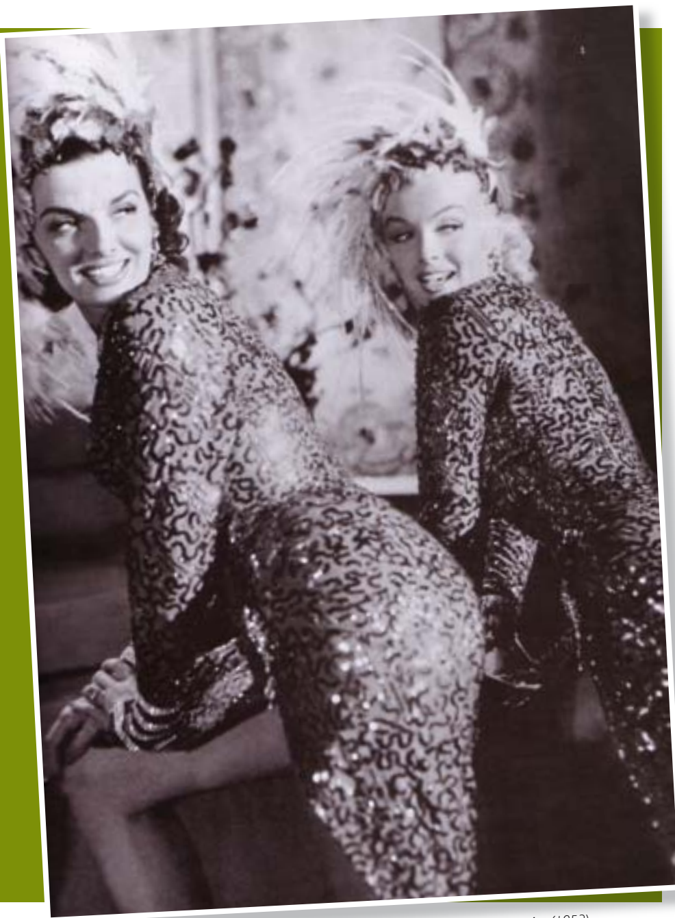
▲ Marilyn Monroe and Jane Russell in a scene from the musical Gentlemen prefer blondes (1953)

2001 Apocalypse now redux. (A special edition re-release of the original film). (Video and DVD)