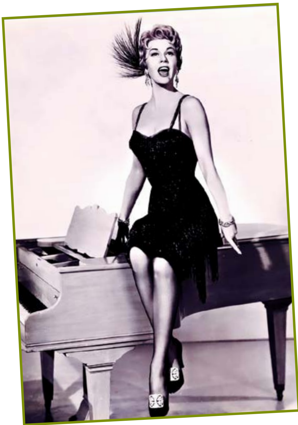
▲ The charming Doris Day in Love me or leave me (1955)