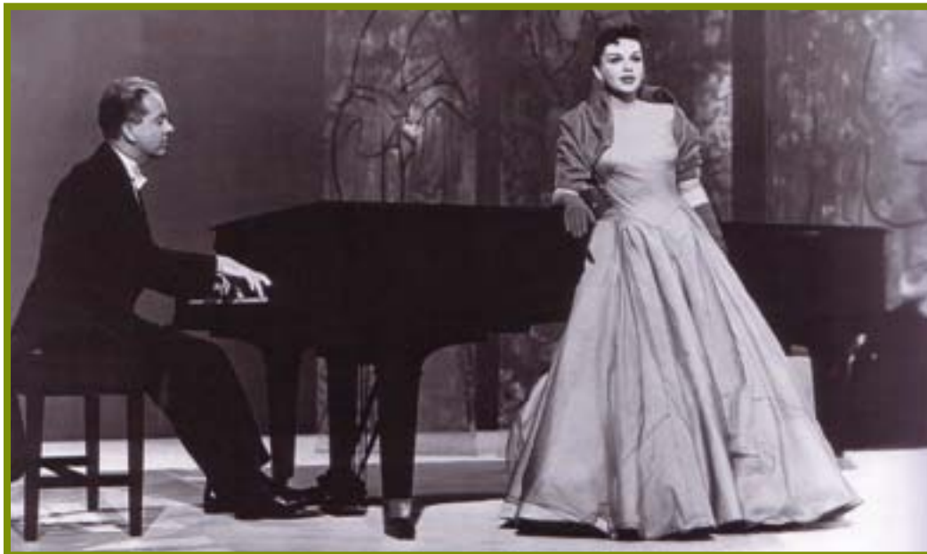
▲ Judy Garland in a scene from A star is born (1954). The film was directed by George Cukor and was considered a comeback vehicle for Judy who starred in what was described as her first electrifying dramatic role