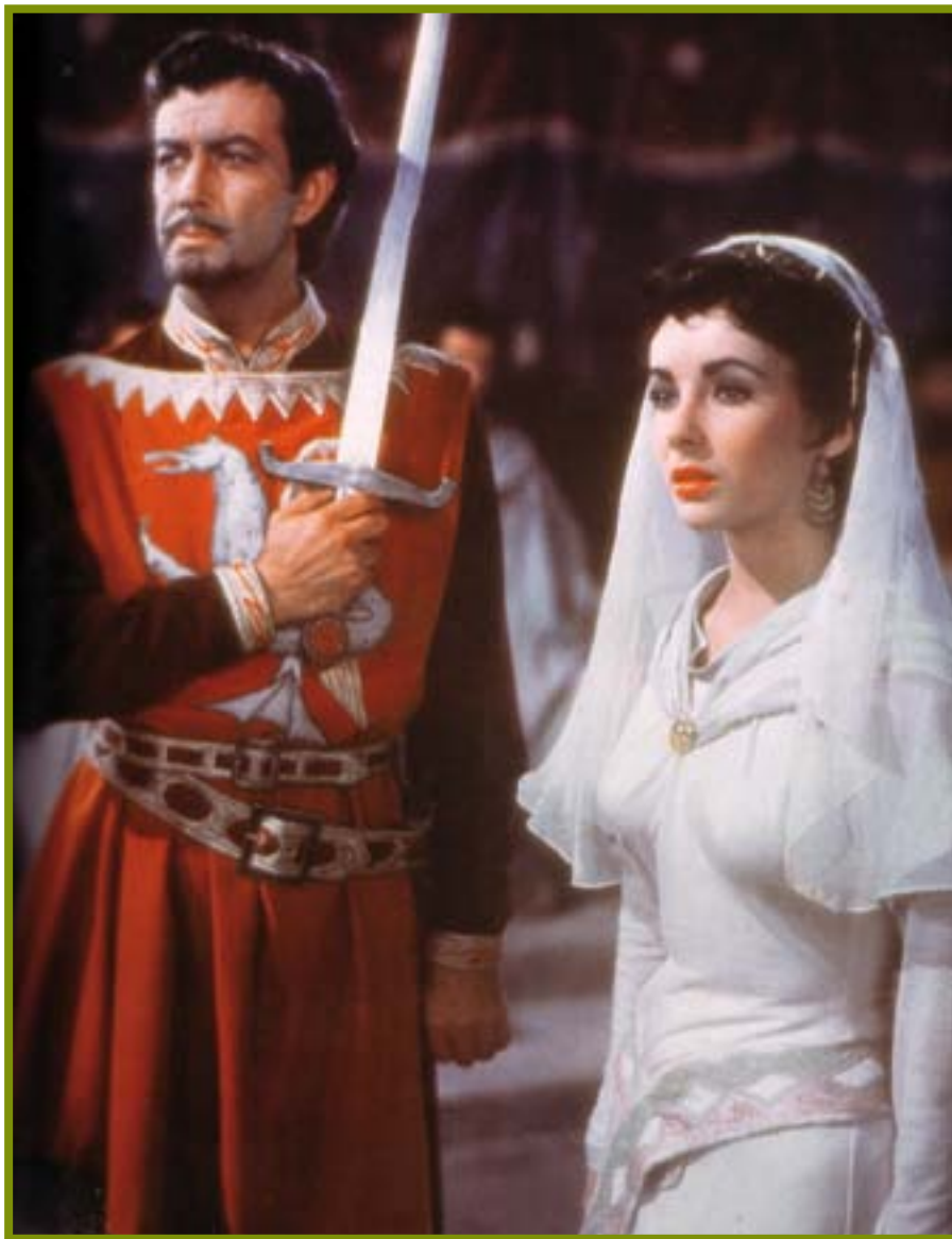
▲ Robert Taylor and Elizabeth Taylor in a scene from Ivanhoe (1952)