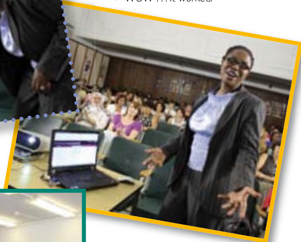
◀ SLIMS training in action

▼ Staff were treated to refreshments after the 'switch-on'