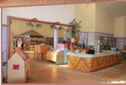
▲ Interesting displays greet visitors to Hopefield Library