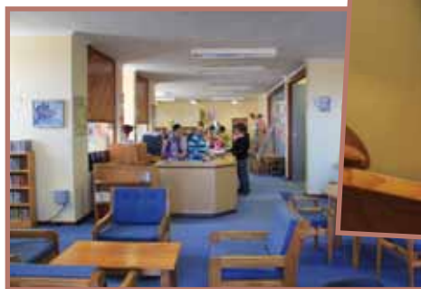
▲ Comfortable chairs entice visitors to enjoy the tranquil cool blue atmosphere in Diazville Library