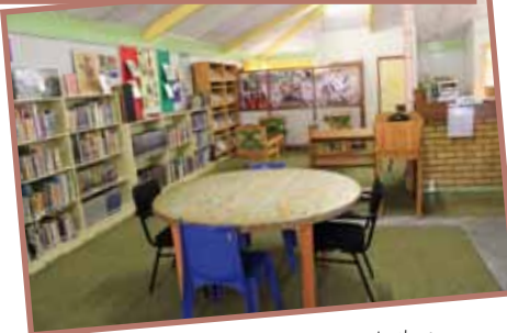
▲ A comfortable area for studying and other activities at Louville Library