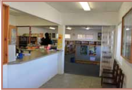
▲ Eendekuil Biblioteek bedien tans 729 lede en tydens vakansietye gons dit in hierdie biblioteek