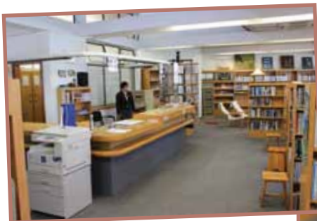
▲ Seen on the right is the children's area where many a child vies to sit on the cute blue and pink chairs at Langebaan Library. The large counter area ensures a comfortable flow for borrowers