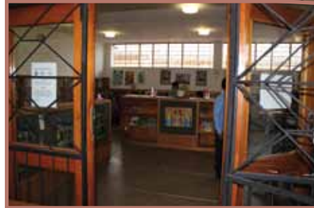
▲ Gebruikers geniet dit om LB Wernich Biblioteek te besoek