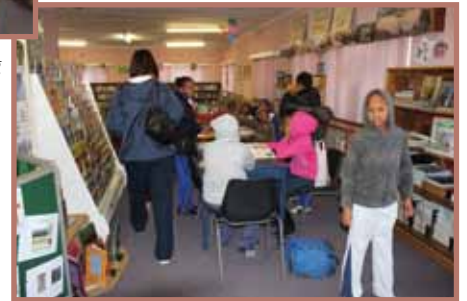
▲ Young users make extensive use of the facilities at Saldanha Library