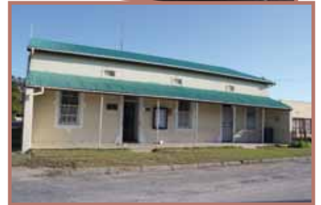
▲ Heelbo: Redelinghuys Biblioteek waar hondjies ook welkom is. Onder: Redelinghuys Biblioteek van buite gesien