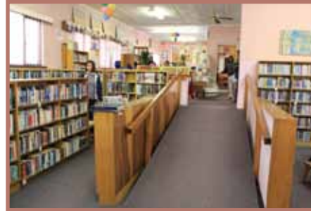
▲ Saldanha Library's planners thought of everything - access for wheel chairs is one of the examples