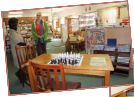
◀ At St Helena Library chess players can pit their skills against each other