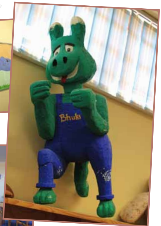
▲ Bhuki inspired many a library to reproduce and display their own. Here such an example is on show in the children's section of Diazville Library