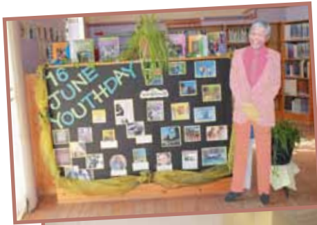
◀ Youth Day celebrations at Hopefield Library featured our national icon, Nelson Mandela