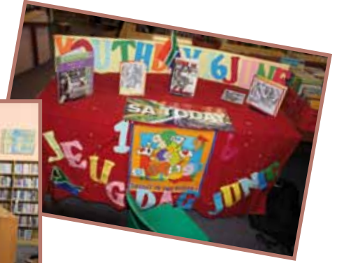
▶ A colourful Youth Day display - just one of the many displays often seen in Saldanha Library