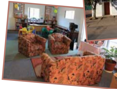
◀ Aurora Biblioteek in die rustige Sandveld. Gebruikers kan heerlik ontspan in hierdie Klein, maar populêre biblioteek