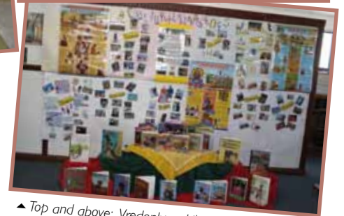
▲ Top and above: Vredenburg Library has the largest staff complement in the area. Services to old-age homes and regular displays are just a few aspects of their many activities