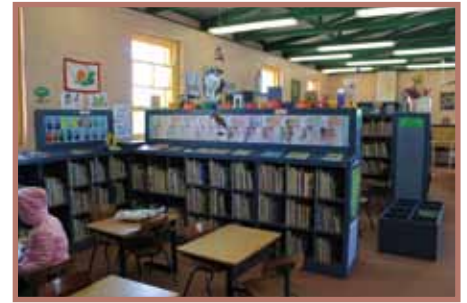
▲ Colourful bookshelves with ample space for displays make the children's section in Paternoster Library a delight to visit

Membership: 2010: 940 Circulation: 2010: 17,827