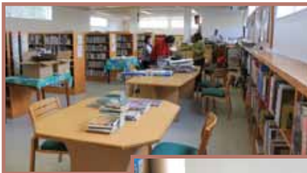
► Veldrif Biblioteek voorsien die gemeenskap in hierdie lieflike vissersdorpie van leesstof en ander ontspanningsmateriaal. Vir ander is daar ook 'n rekenaar-afdeling om van gebruik te maak