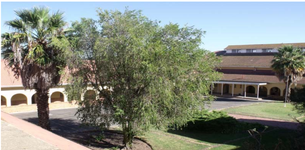
Gene Louw Traffic College

We aspire to grow and develop so as to be recognized as an efficient and professional team providing service excellence.