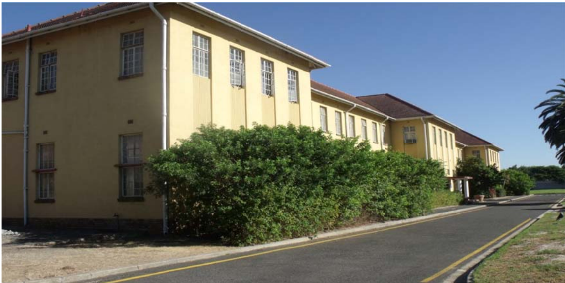
Front entrance of Gene Louw Traffic College