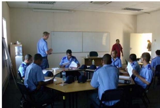
Learners doing groupwork at Traffic Officer training