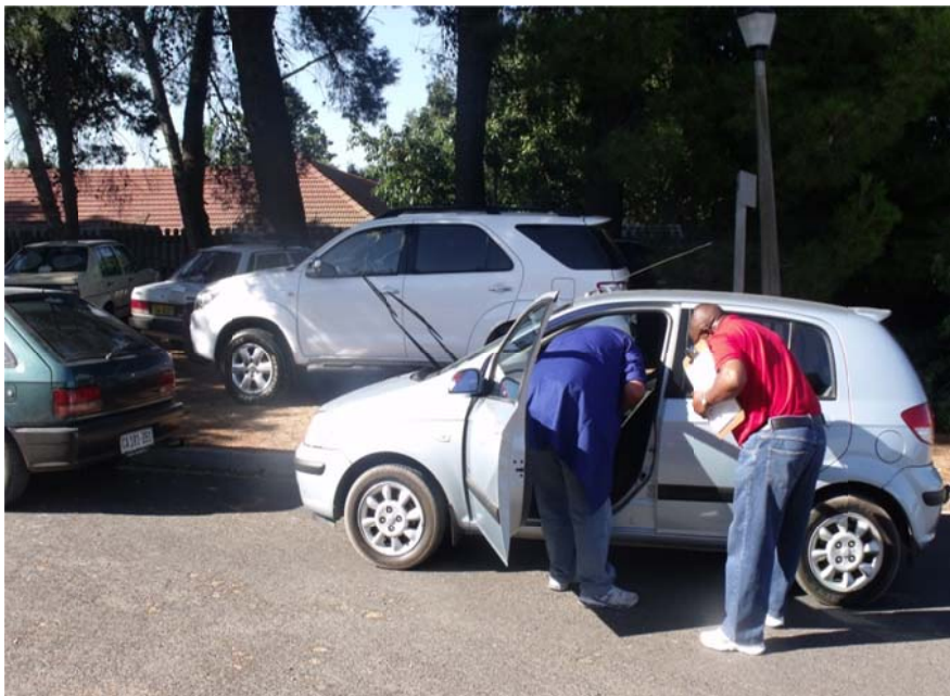
Learners at EOV training

Course hours: Monday to Fridays: 08:00 to 16:00