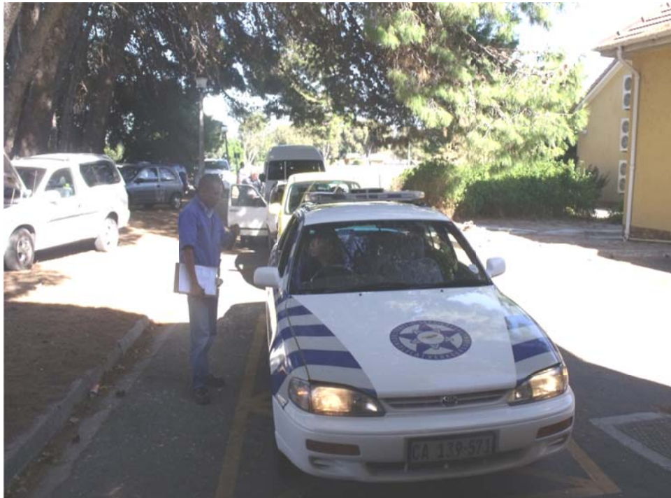
Learners conducting pre-trip inspection prior to road test at EDL training

NB: It will be the duty of (or an obligation) the learner to have foreign qualifications evaluated by the South African Qualifications Authority before enrolment.