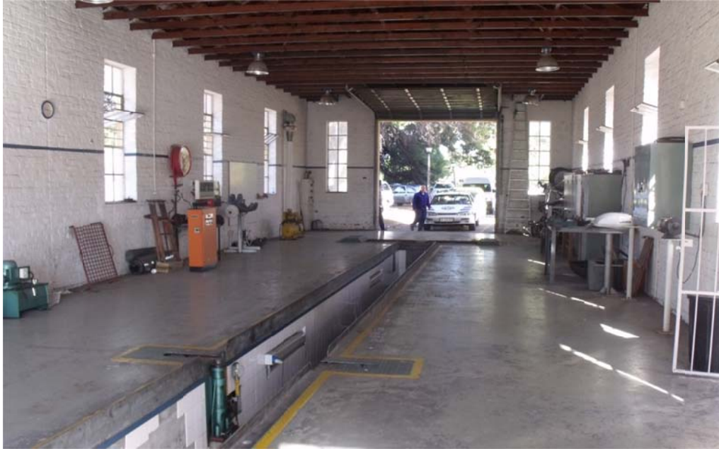
EOV pit area