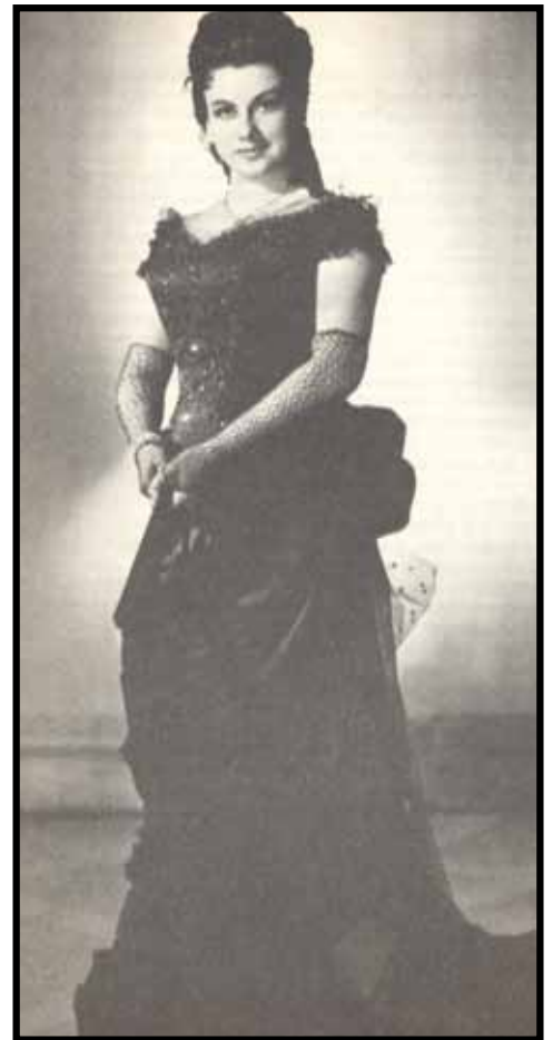
▲ 'n Briljante Violetta

Note: The above mentioned books and CDs are available in the Central Collection.