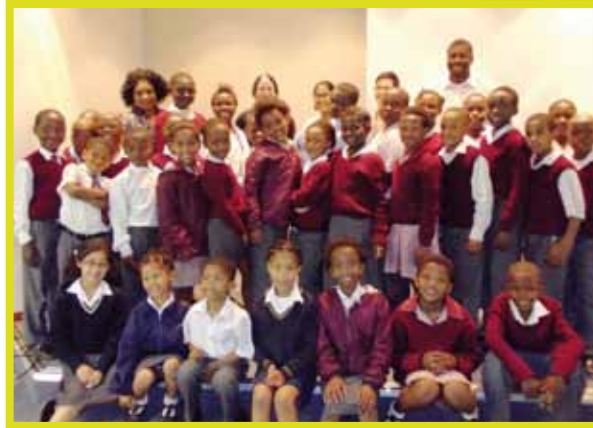
▲ Learners who attended the Milnerton Library 2012 Reading Programme graduation ceremony, held on 25 October in the library auditorium