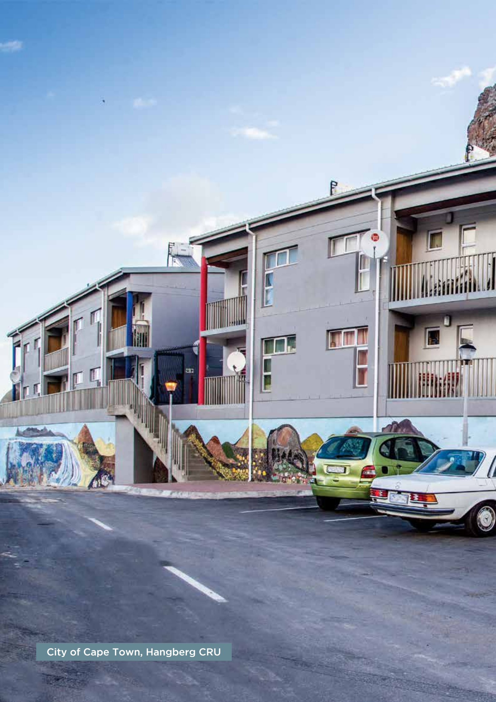
City of Cape Town, Hangberg CRU