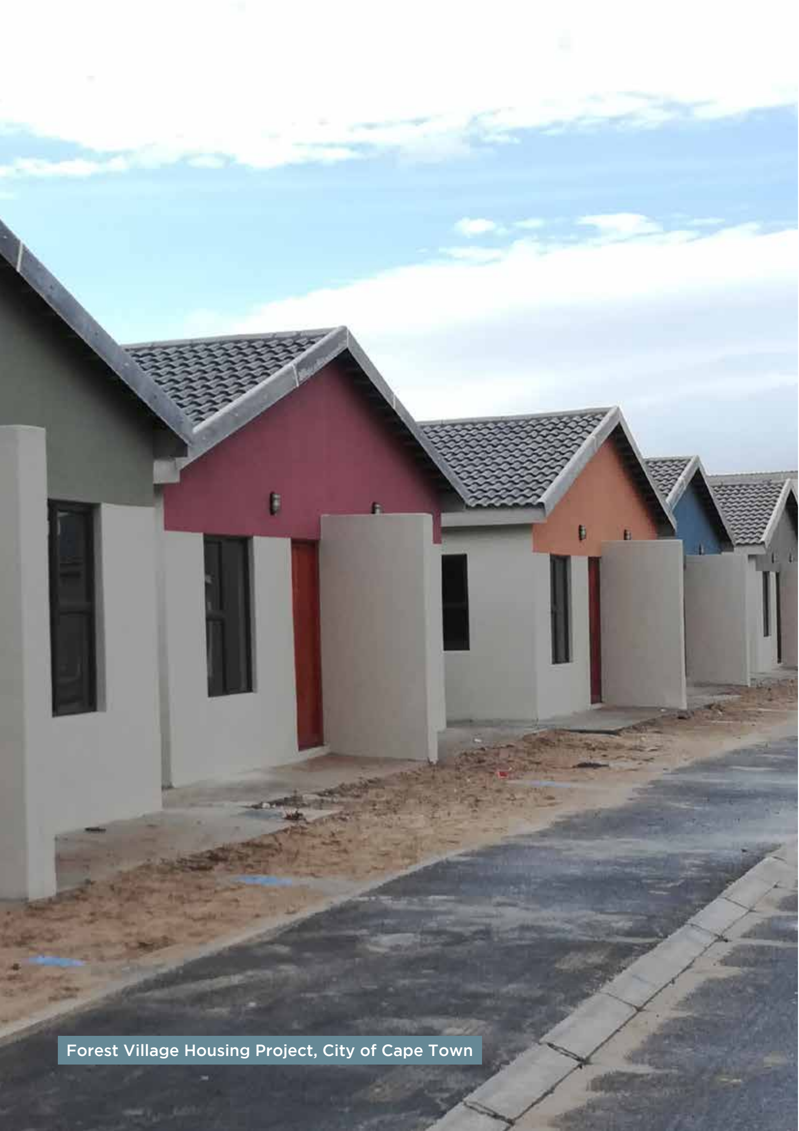
Forest Village Housing Project, City of Cape Town